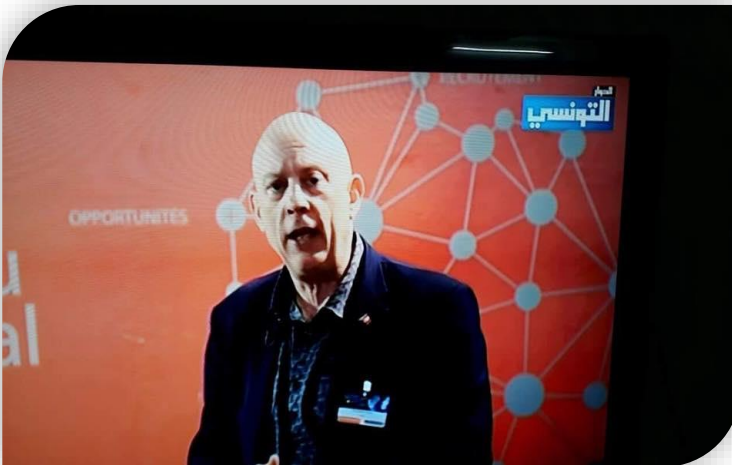
Passage à la télé aux heures de pointes : iTech, Émission 'Spécial TIC' sur Ettounsiya TV, Edition du 14 Avril 2018 à partir de 20H30

The Canadian delegation to SITIC AFRICA 2018 also benefited from an unrivaled media coverage that , for example, included and article published in : Entreprises Magazine - Le Magazine Tunisien des Affaires et de la Finance , Mai 2018 Edition: « Africa is a talent pool for Canadian companies. »