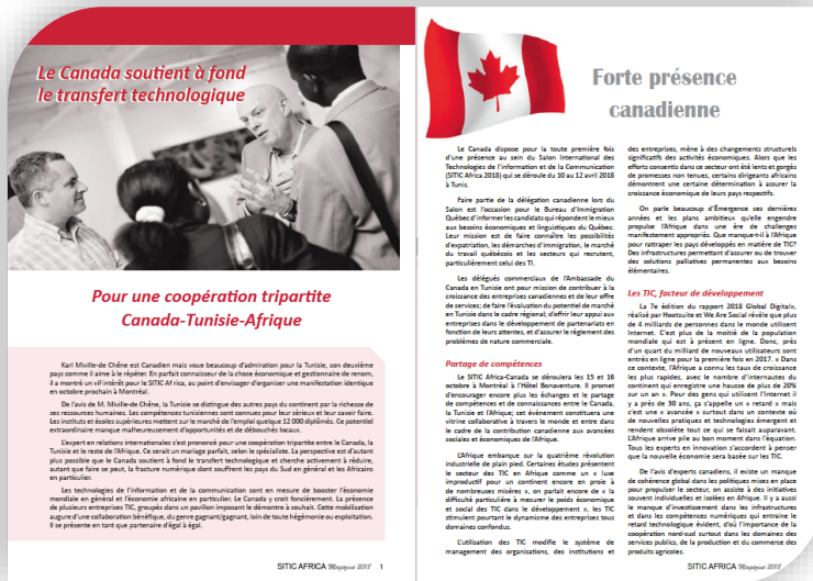
Article paru dans le magazine du SITIC Africa.

and institutions, for an estimated total of 864 B2B meetings (24 x 36) with potential local partners.