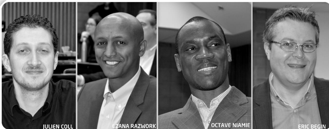
TABLE RONDE - L'OPPORTUNITÉ NUMÉRIQUE AFRICAINE

with the Forum on the African Digital Opportunity - SITIC AFRICA CANADA 2018 – in October 15 and 16, 2018 in Montreal.